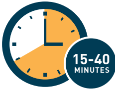
INTERVIEWER-ADMINISTERED CARS SCREENER