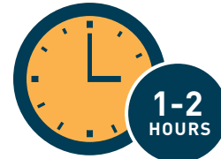
FULL CARS ASSESSMENT